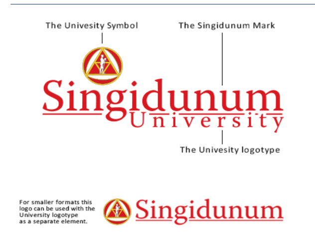
Image 2. An example of an alternate mode of Singidunum University's logo

Another example is shown in for Singidunum University's logo in Image 2. A well-defined branding guideline provides an alternate format of logo that could be used in smaller areas.