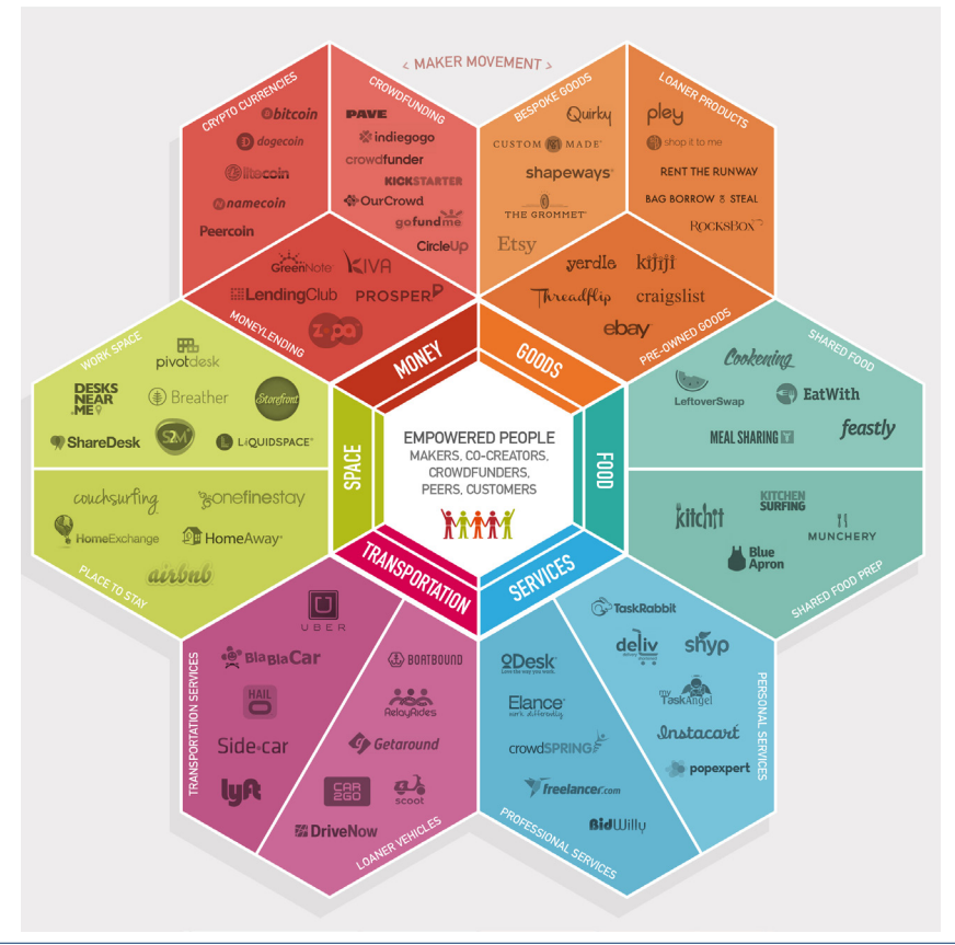
Figure 1. Collaborative Economy Honeycomb (Owying, 2014)

Authors Hamari, Sjoklint and Ukkonen (2015) expect that CC, as an economic and social category, will contribute to slowing down and decreasing some societal problems such as hyper-consumption, pollution, and poverty by lowering costs of economic coordination within communities. Rapid population growth and resource depletion provoked the need for establishing models which will enable access to and consumption of goods and services. Peer-to-peer exchange has proved to be the way to put up with the above-stated societal problems. The authors emphasize that there is actually a lack of information and deeper understanding of why people would participate in collaborative consumption. The research (Hamari et al., 2015) investigates customers' motivations to participate in collaborative consumption (CC). The study included 168 participants who were registered onto a CC site. It was discovered that the basic motivators are CC sustainability, personal enjoyment of the participants in the activities, and economic gains. In addition to that, the authors found out that people perceive the CC activity positively, but, at the same time, they