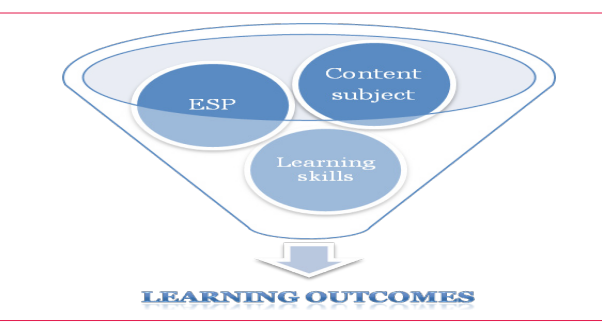
Fig. 2 Combined learning outcomes for the online component of the course