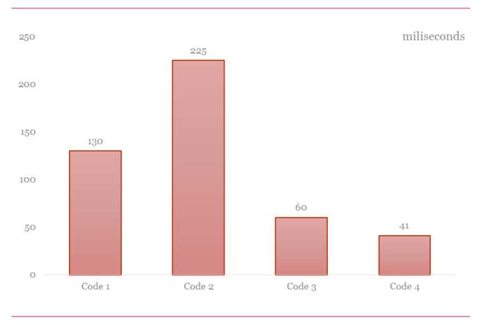
Figure 2. Query execution time

Based on the chosen formula, SQL query was created in MySQL DBMS, an execution that proved not fast enough, after which the original request was modified. Thus, query execution time was reduced for about half a second, which did not constitute a sufficient performance improvement. The original request was included in the procedure, where the query execution time was reduced for an additional 0,4 seconds, and at the end of the procedure, it included a modified request with achieved execution speed of 0,6 seconds in the standings than 5.000 records.