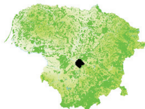
Fig. 1. Location of the study area

The study was conducted in Dubrava forest in central Lithuania and its neighbourhood (Fig.1). Total area under focus was about 20000 ha.